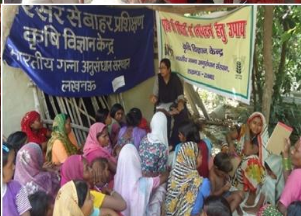
Highlights of training programs for practicing farmers and farm women