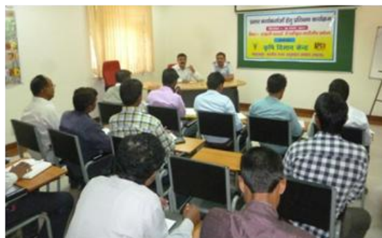
In-service Training Programme