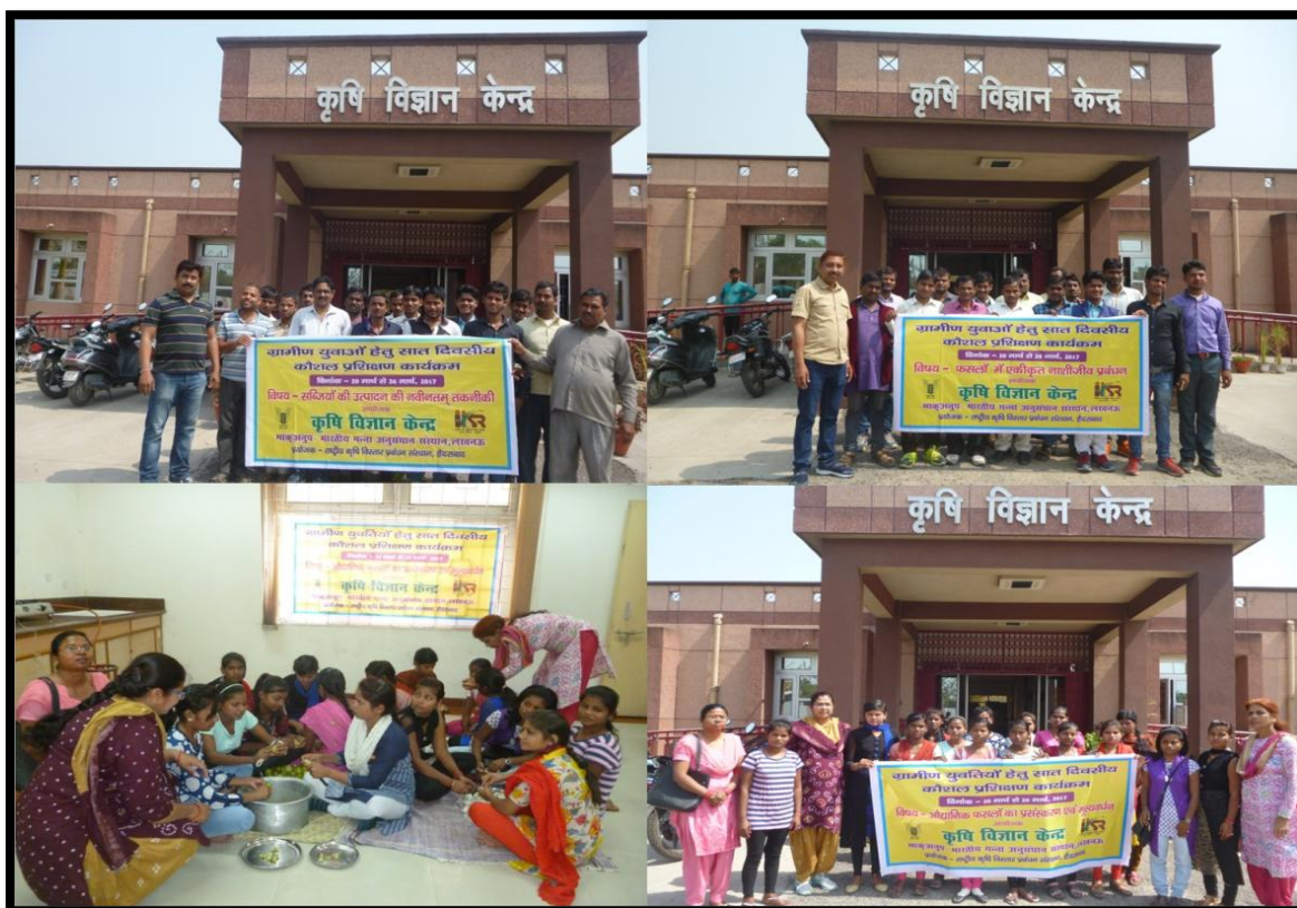
Vocational training program for rural youth